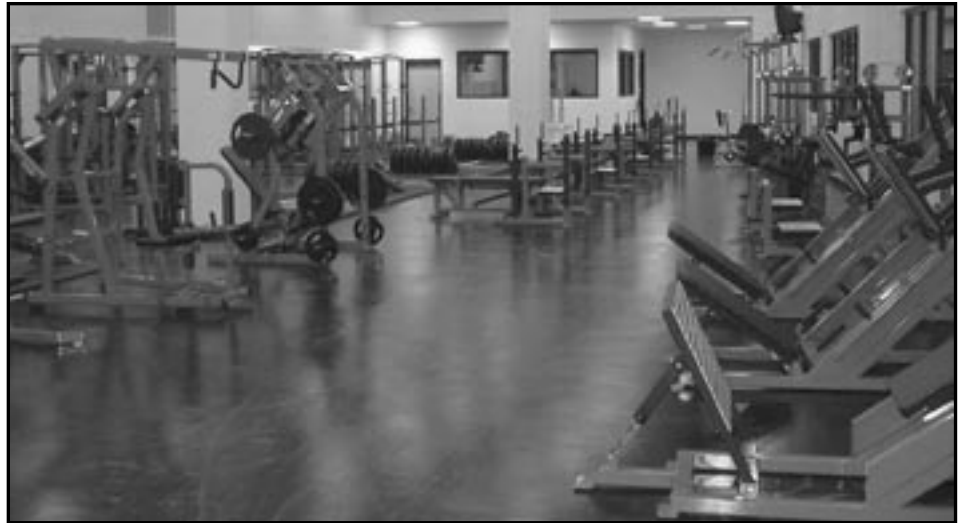
The Terps' new state-of-the-art weight room at Comcast Center.