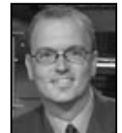
Scott Van Pelt